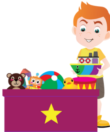
TIDY UP TOYS