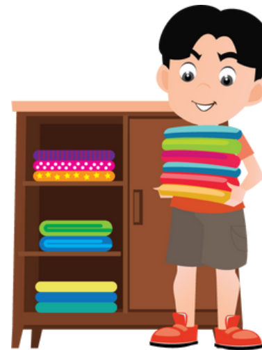
TIDY UP CLOTHES