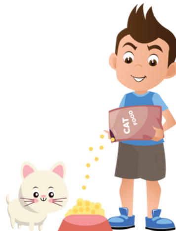
FEED THE CAT