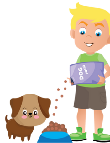
FEED THE DOG