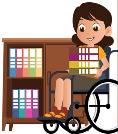
TIDY UP BOOKS